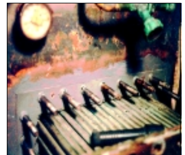
REPAIRED HEAT EXCHANGER FLANGE