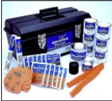
BELZONA MARINE EMERGENCY REPAIR KIT

Belzona® Tourniquet 25 disposable working surfaces 2 spatulas 4 applicators Impermeable vinyl gloves Material Safety Data Sheets Instruction leaflet