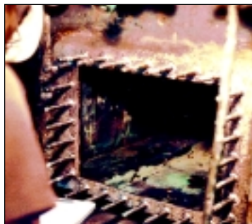
DISTORTED HEAT EXCHANGER FLANGE